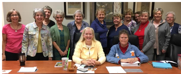
“We are Pearl Homes. Are You? Please join us!” (CGCVB Board members)

I would love to hear from your club's conservation chairman about how many of your members are currently designated a Pearl Home and then, at the end of the year, we'll check to see how many more members have joined. Wouldn't it be wonderful if we could reach 100% participation! We truly believe that if each of us makes some small changes to benefit the environment, together we will have a big and positive impact. I look forward to hearing from you.