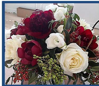
Red Charm Peonies Ligustrum w/ Green Berries White Polo Roses White Ranunculus Little Gem Magnolia Upright Brazilian Pepperberry