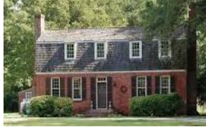
Whitehurst-Buffington Historic House 2441 North Landing Road Virginia Beach, Virginia 23456