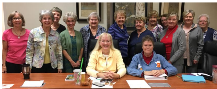
“We are Pearl Homes. Are You? Please join us!” (CGCVB Board members)

I would love to hear from your club's conservation chairman about how many of your members are currently designated a Pearl Home and then, at the end of the year, we'll check to see how many more members have joined. Wouldn't it be wonderful if we could reach 100% participation! We truly believe that if each of us makes some small changes to benefit the environment, together we will have a big and positive impact. I look forward to hearing from you.